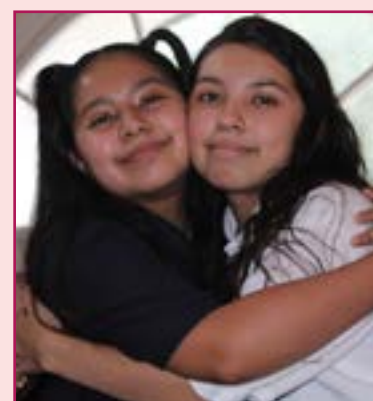
The Guerrero Sisters love OLT

It is only together that we move forward, it is only together that we are Tepeyac!